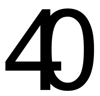
TABLE OF CONTENTS 1 5.2 Spars